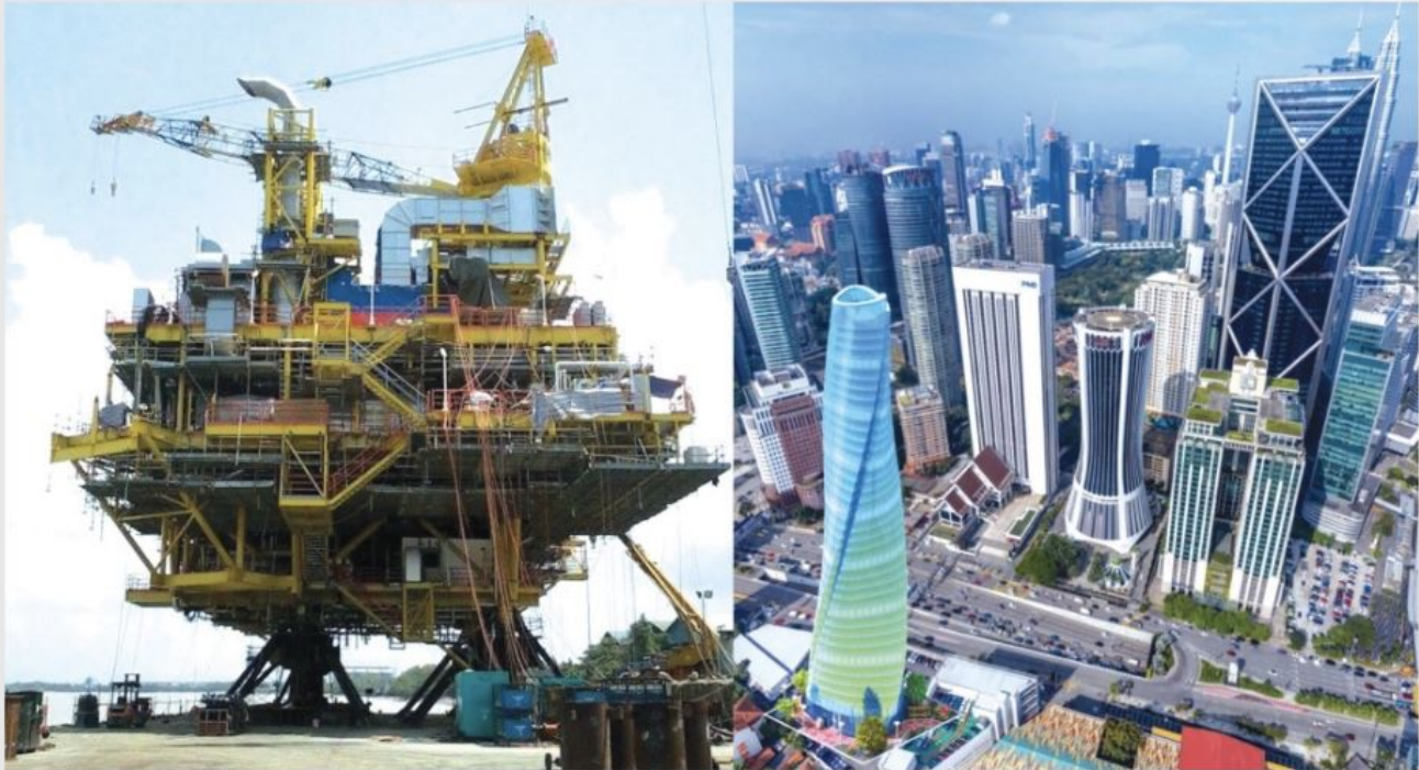
Renderings subject to change.